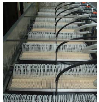
MBR tank + MBR modules