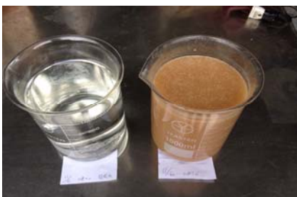
Left: discharge right: raw water