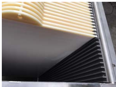
Element cassette and insert track