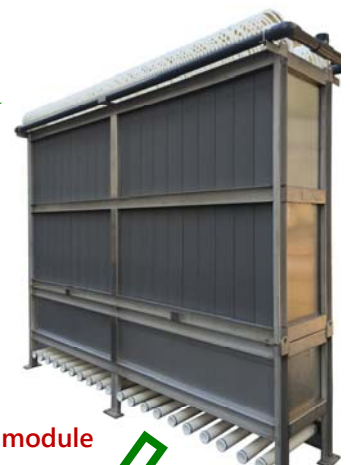
Ecologix MBR module