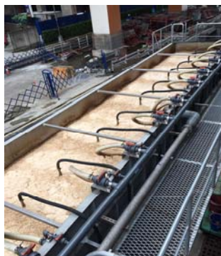
MBR in operation