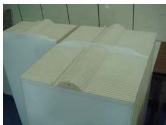
PVDF membrane plate (element)

The superior filtration function and retain the sludge, enhance MLSS to carry out the high-efficiency decomposing biological characteristics, not only improve the quality of the effluent, but also reduce 1/2 area of sewage treatment plant and 1/2 of the waste sludge.